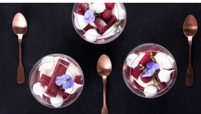
ART ON A PLATE DISHES WITH CAREFULLY CURATED INGREDIENTS