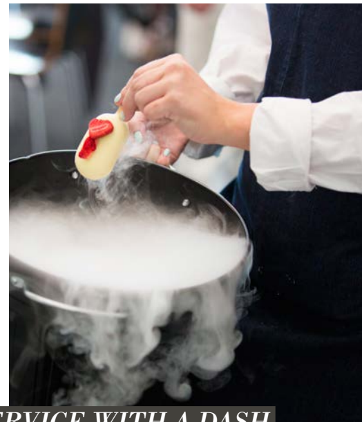
SERVICE WITH A DASH OF DRAMA BRINGS EXTRA PANACHE