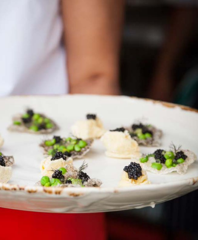
EYE FOR DETAIL WITH CUSTOM CREATED PRESENTATION